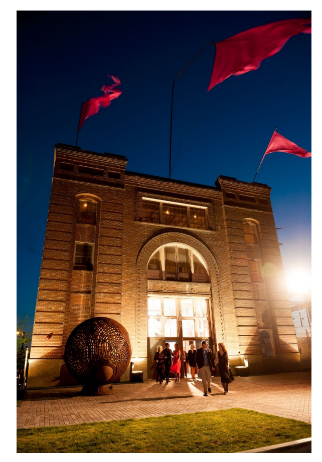
Power House Theatre Walla Walla