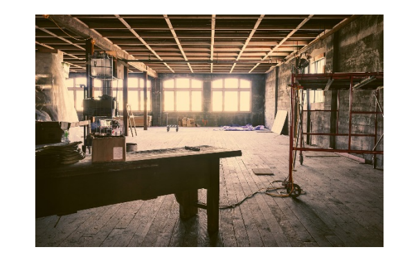
Tacoma Art Museum and Sylvia Center for the Arts (Bellingham)